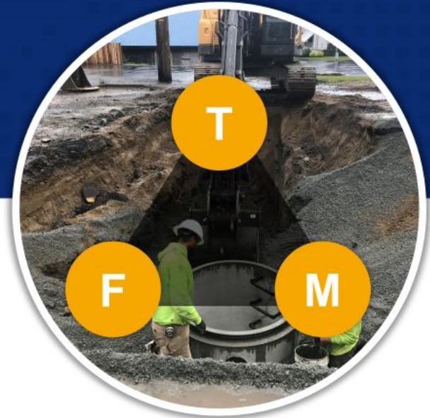
Limited Local Capacity