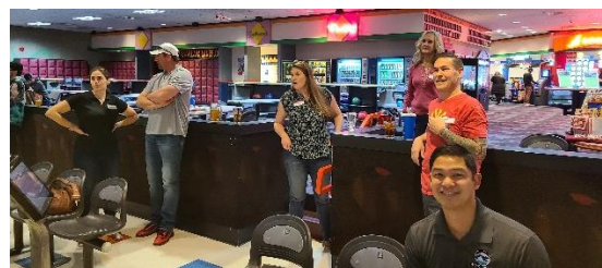
YP Bowling Event