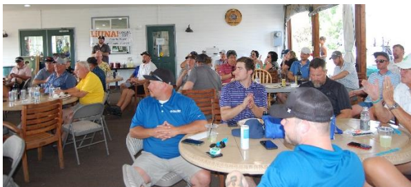
11 th Annual WFP Golf Tournament