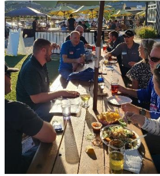
YP Cornhole Tournament