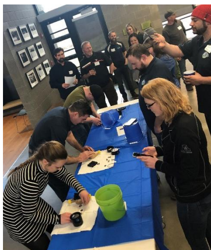
Meter Madness frenzy at the KC Water Olympics.

The King County Water Olympics was held on March 14 th at the Brightwater Facility in Woodinville, WA. The winners of each contest moved on to the PNWS-AWWA Section Conference held in Vancouver, WA in early May. This is also a membership appreciation event, with free attendance. We had over 70+ attendees and 15 sponsors.