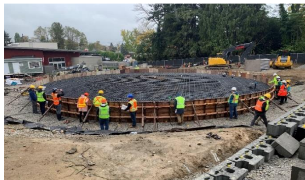
Attendees observe the tank retrofit on the YP Site tour, hosted by the City of Renton.

On Friday, October 18, 2019, the City of Renton hosted a site tour of their new 1.29 MG Kenneydale reservoir. When constructed, the reservoir will be 103-ft tall, 50-ft in diameter with a 350 CY concrete mat slab and 80 auger cast piles ranging from 46 to 52-ft deep. The City of Renton, Murraysmith, Peterson Structural Engineers, and HWA Geosciences were all on site to discuss and answer questions about their respective roles and contributions to the project. The tour was exclusively held on the active construction site where attendees got to see and hear about the design and construction process of the vaults, piping, auger cast pilings, and the concrete mat.