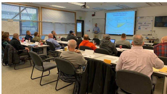
Attendees at the Water Loss Control Class.

King County Subsection hosted this technical workshop on November 7 th , 2019 at the City of Issaquah's Public Works Operations Facility to provide instruction on the AWWA M36 Water Audits and Loss Control methodology and software. Attendees learned the methods and technologies to economically control water and revenue losses by managing leakage and pressure.