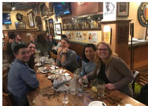
YPs and students gather for the post UW Career Fair Social at Shultz's on the Ave

KCSS partnered with the local King County Pacific Northwest Clean Water Association (PNCWA) chapter to host a resume night with the student chapter of AWWA-WEF in preparation for the University of Washington Civil and Environmental Engineering Career Fair, as well as a social after the fair. The resume night on January 15 th , 2020 provided an opportunity for UW students to drop in and get their resume reviewed by a Young Professional. We had a great group of students and YP's for the event, along with pizza sponsored by the KCSS and PNCWA.