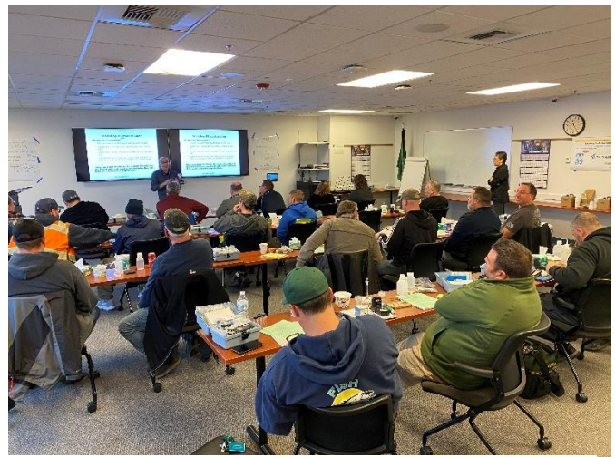
Attendees at the Chlorine Residual Workshop.

This training was taught by Office of Drinking Water staff on February 4 th , 2020 in Kent, Washington to provide increased knowledge and experience as recommended by the Disinfection Data Integrity Project (2015). Both morning and afternoon classes with 22 students (capped for space and material limits) provided drinking water operators with a better understanding of good lab skills and chlorine measurement techniques and why they matter. It also provided operators with hands on skills to answer the questions: How do I know my instrument is working? 2) How do I know that the residual that I measure is real? And, how good is my technique? 0.3 CEUS were earned for ea