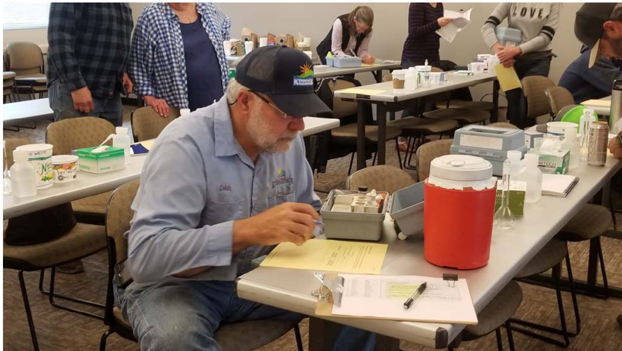
May 14, 2019 – DOH Chlorine Residuals Training